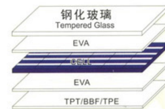
FIGURE OF STRUCTURE