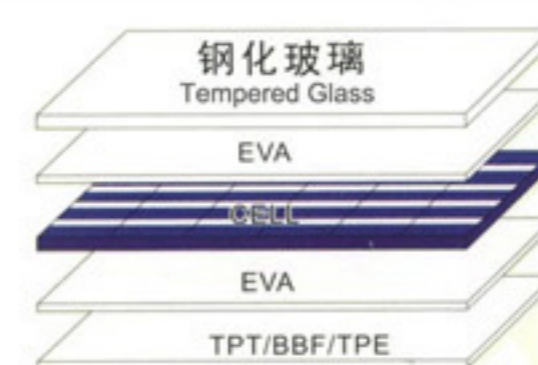
FIGURE OF STRUCTURE